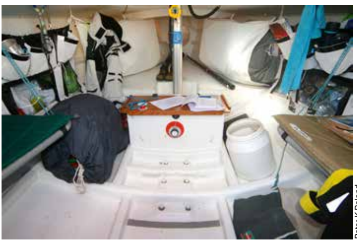
A typical production Mini 650 interior... plenty of space, but not a lot of creature comforts. The lighter they are, the faster they go!