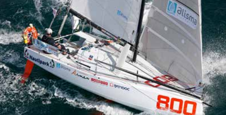
Nautipark (Frederic Denis) wins in the Proto class in 2015. Note the daggerboards, canting keel, chine, flat bottom and twin rudders

Simon Rogers is also impressed by the latest 'scow bows' and fuller forward sections, saying: 'Short fat hulls tend to stand on their diagonal and bury the bow.