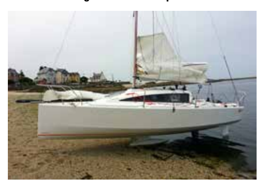
The Django 670, a lift-keel cruiser loaded with Mini Transat genes