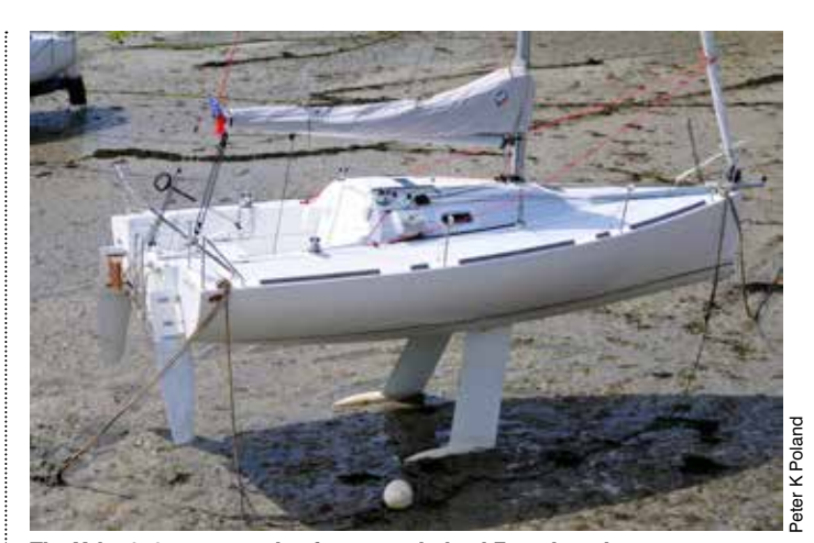
The Yaka 650, an example of a neat twin-keel French cruiser developed from a Mini Transat 6.50 racer

However, the 6.50 class now realised that there was a risk attached to all these exciting yet high-cost innovations. There was a chance that the boats could become so expensive that 'normal' sailors would become excluded, so the Minis were divided into Prototype (Protos) and Production (Series) classes. The Protos are custom-built while the Series class is for production boats, featuring a simpler 'box rule' that stipulates alloy spars,