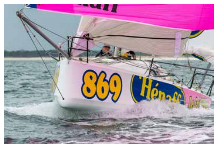
The Pogo 3's rounded bow is efficient upwind and downwind

AFEP Marine's new Rêvolution 22 and 29 models are the most dramatic Mini spin-offs. Designed by David Raison, these aluminium-hulled and scowbowed cruisers look like nothing else afloat. Internal volume thanks to 'that' bow - is astonishing in both the 22 and the 29. The French nautical magazines already seem impressed by the performance and potential of the 22. Raison told me the Rêvolution 35 project has also just started, saying: 'This is very promising. Freeboard and aluminium structure load can be better managed at this size. The boat will offer enhanced performance and comfort with light scow aesthetics, and three twin cabins.' The big question is whether people will accept these aesthetics. Only time will tell. The added accommodation is undoubtedly a bonus, and the French do have a habit of breaking with tradition and coming up with winners.