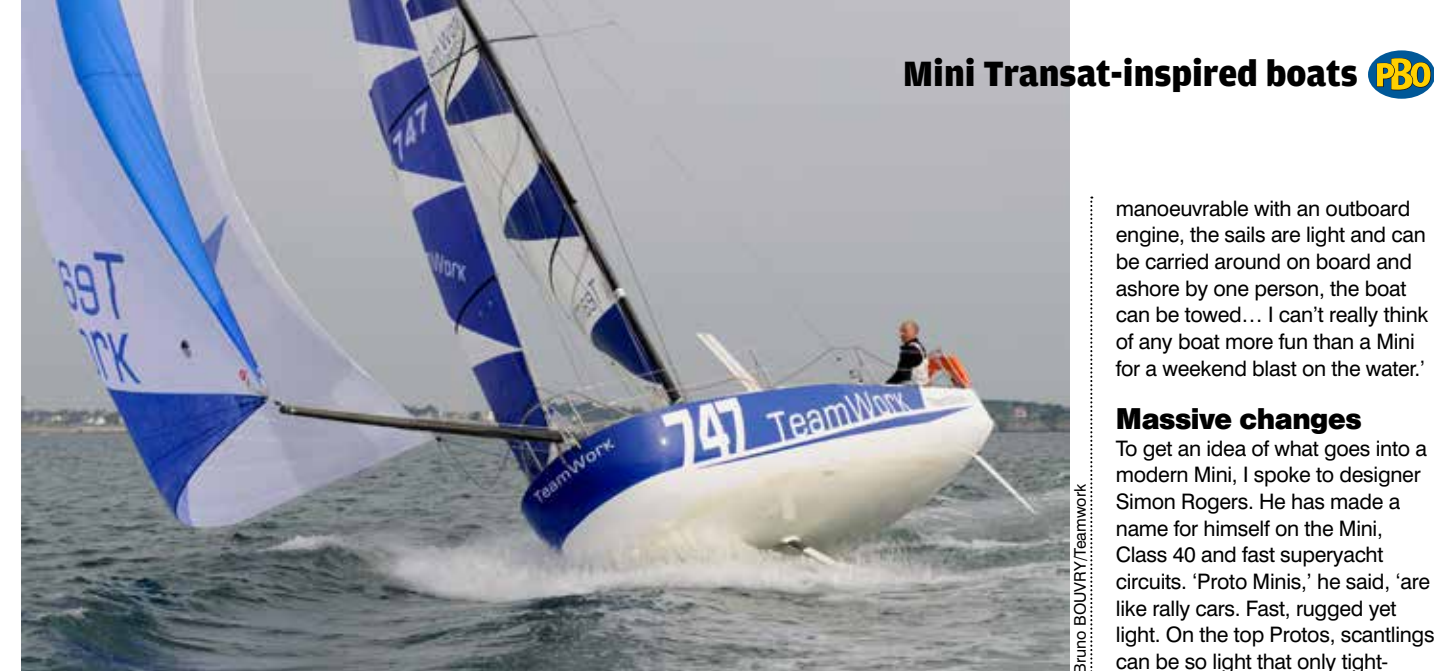
David Raison's revolutionary TeamWork Evolution ran away with the 2011 race