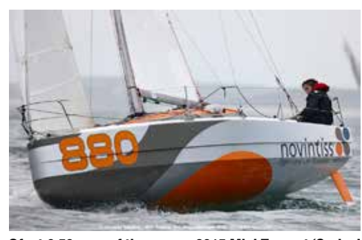
Ofcet 6.50: one of these won 2015 Mini Transat 'Series' production class. The rounded bow and chines contribute to speed and stability

topsides keeps the bow up and improves lift for early planing. The only weakness is light airs speed. The extra volume is beneficial to cruising yachts, provided the aesthetics are acceptable. Clever styling helps. The chines enhance performance on light boats, but not on heavier ones. However they increase space, stability and sail carrying power on cruisers.'