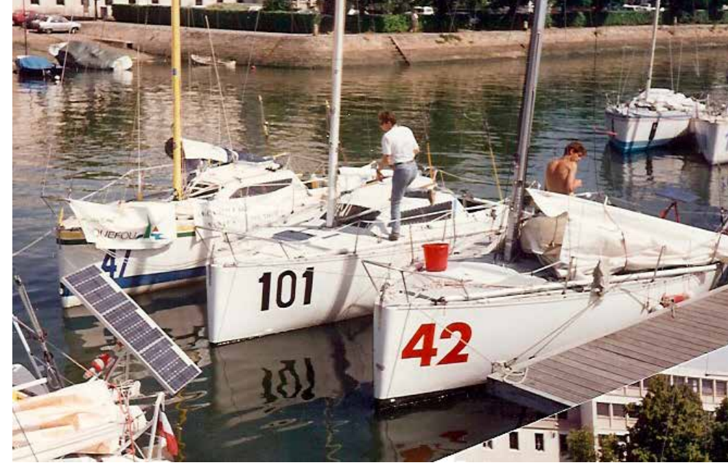
Coco class Mini Transat yachts before the start of the Vannes-Azores-Vannes race in the 1990s

In 1985, the French took over the race. Founder Bob Salmon